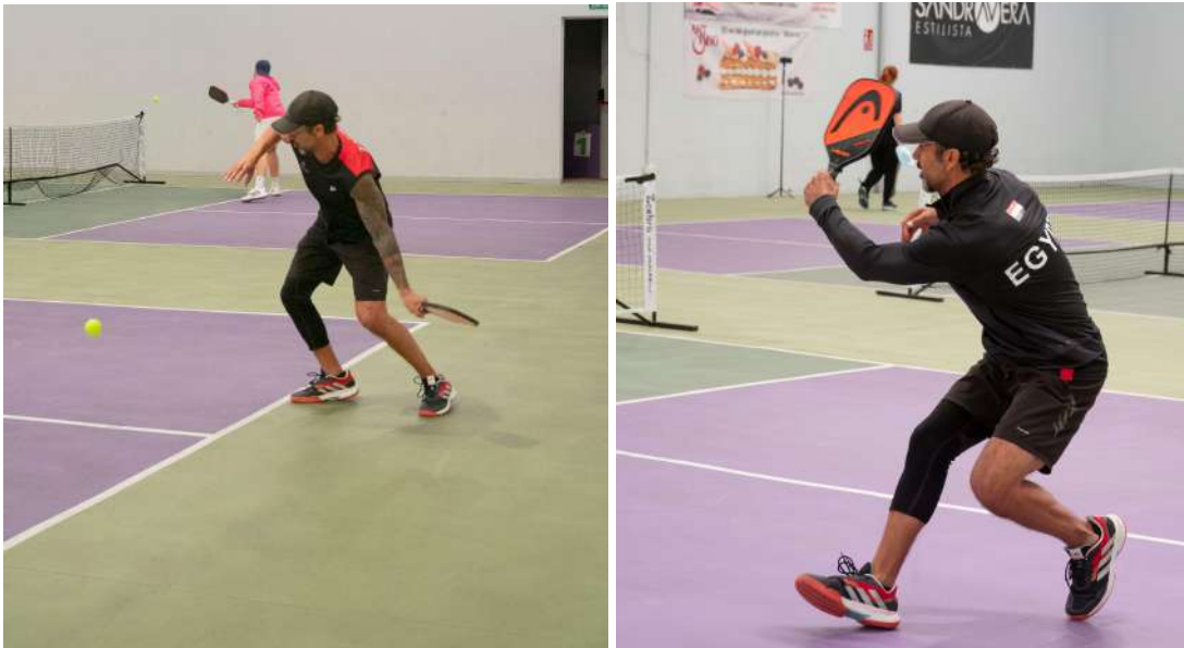
Reference images. Vila Pickleball Sabadell