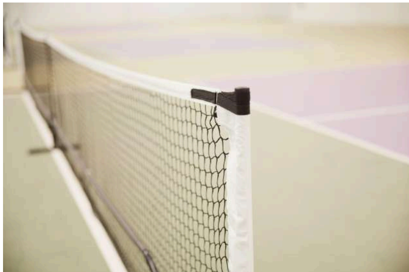
Reference images. Vila Pickleball Sabadell