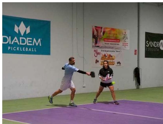
Reference images. Vila Pickleball Sabadell